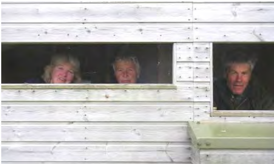
Taking shelter, BSBI Field Meeting to Tiree, 2009

Even more importantly, the mobilisation of paper records benefits conservation. The records will be available to SNH and other conservationists via the National Biodiversity Network (NBN) Gateway, and the BSBI website who will be able to use them in their day to day work to conserve rare plant populations. Which is exactly what we want - we don't want valuable records gathering dust in attics whilst rare plant populations continue to be lost!