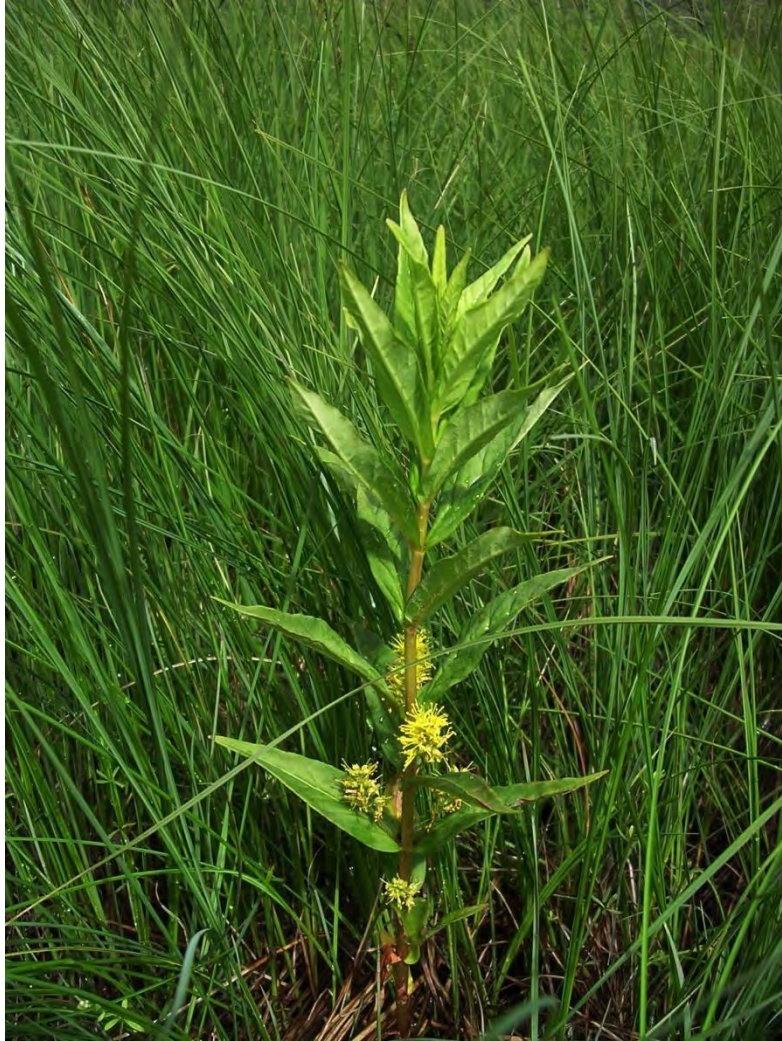
Lysimachia thyrsiflora - Tufted Loosestrife