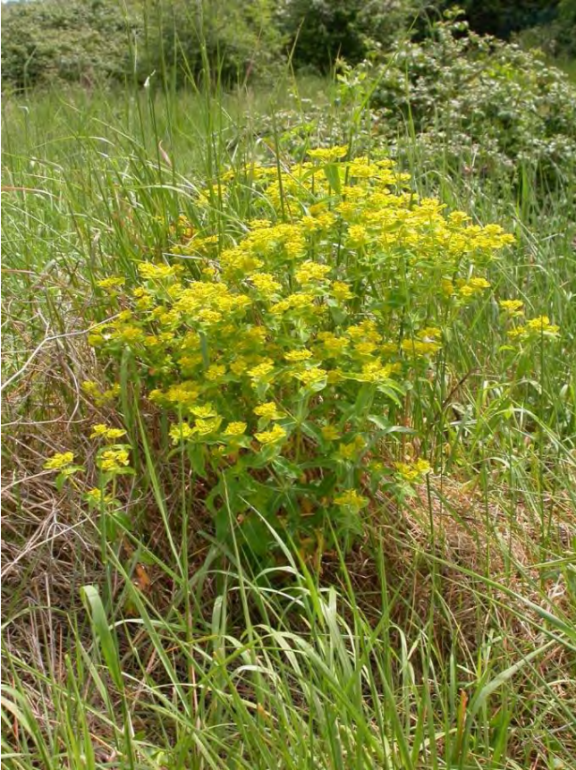
Sium latifolium at Woodwalton Fen