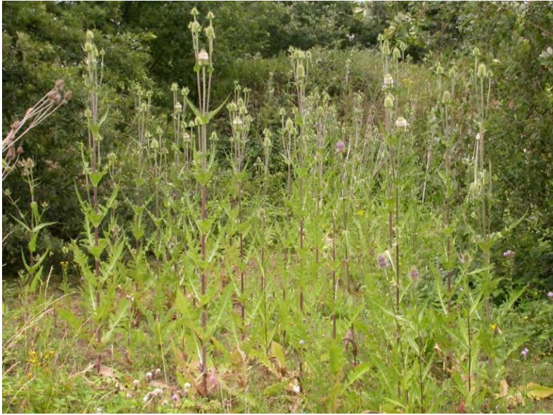
Dipsacus laciniatus at Paxton pits