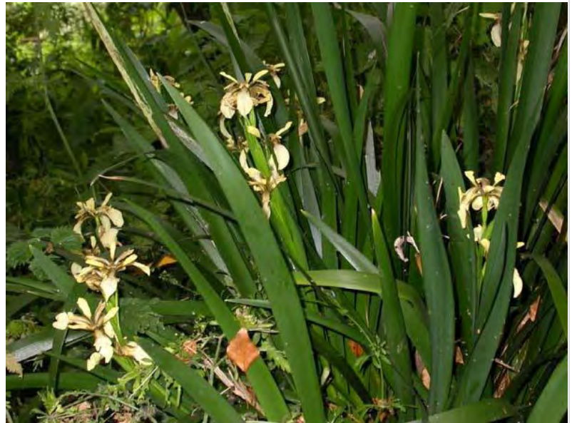
Iris foetidissima var. citrina at Godmanchester