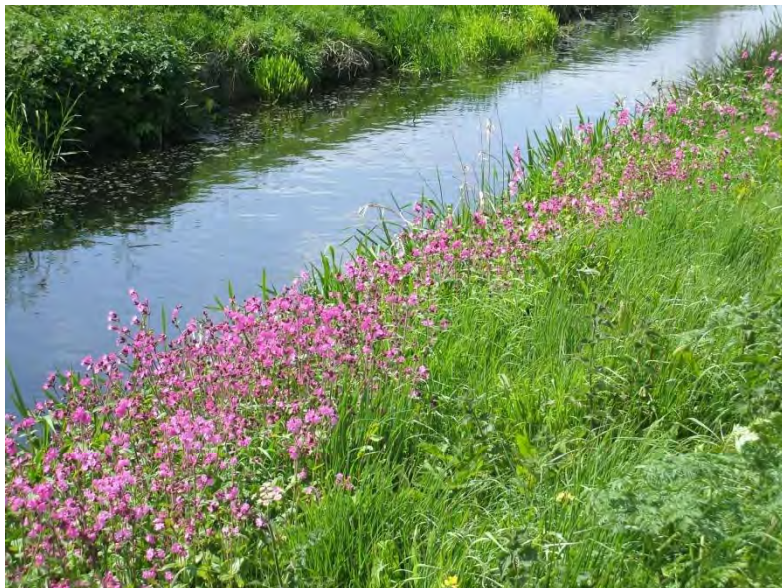
Silene dioica by the Ellington Brook