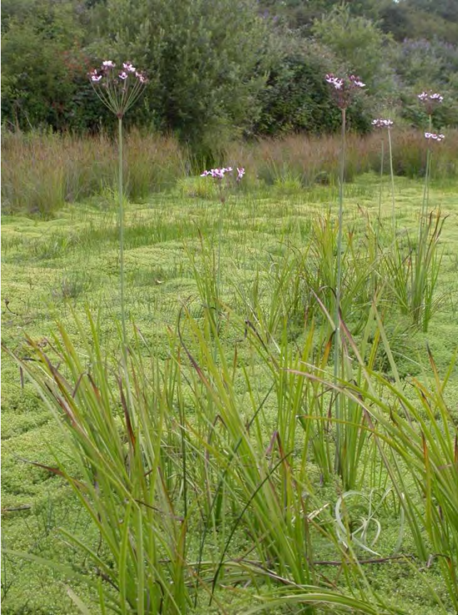
Orchis mascula at Aversley Wood