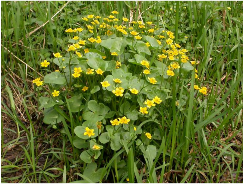
Caltha palustris at Eynesbury