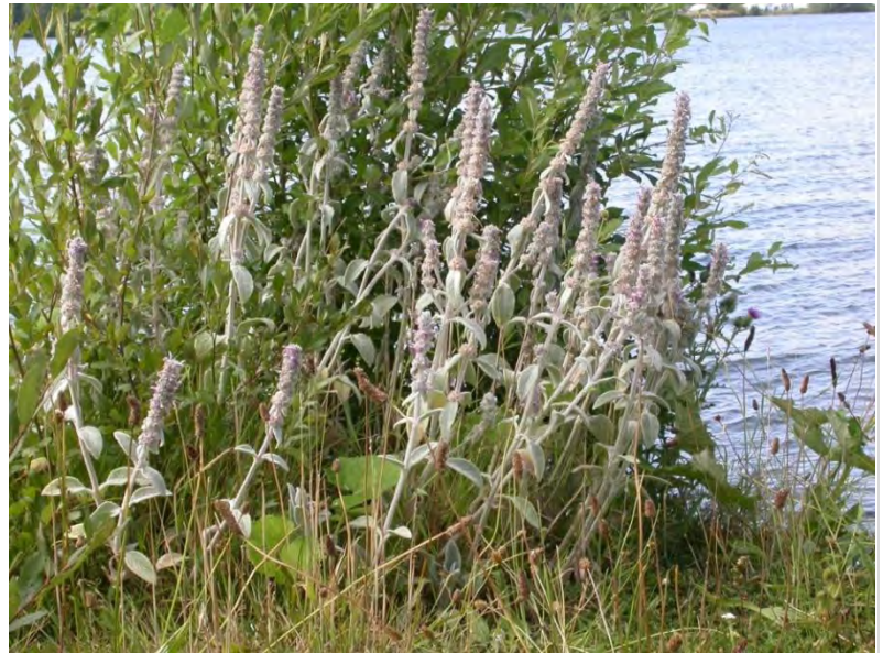
Stachys byzantina at Paxton Pits