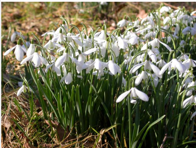
Galanthus nivalis f. nivalis at Holme Fen