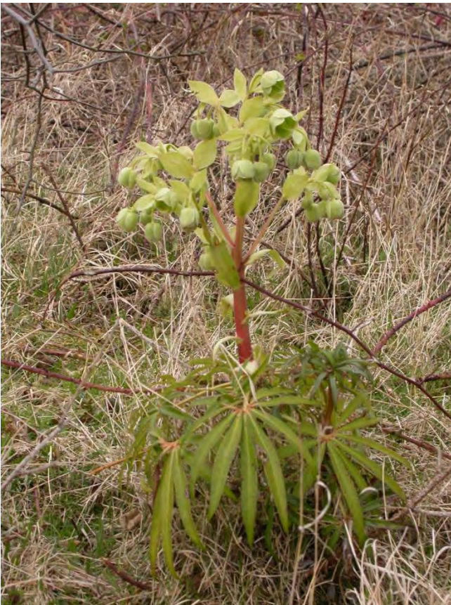
Verbena bonariensis at Paxton Pits