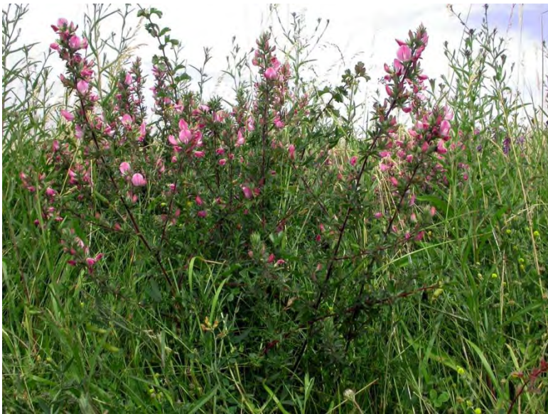
Ononis spinosa by Bullock Road