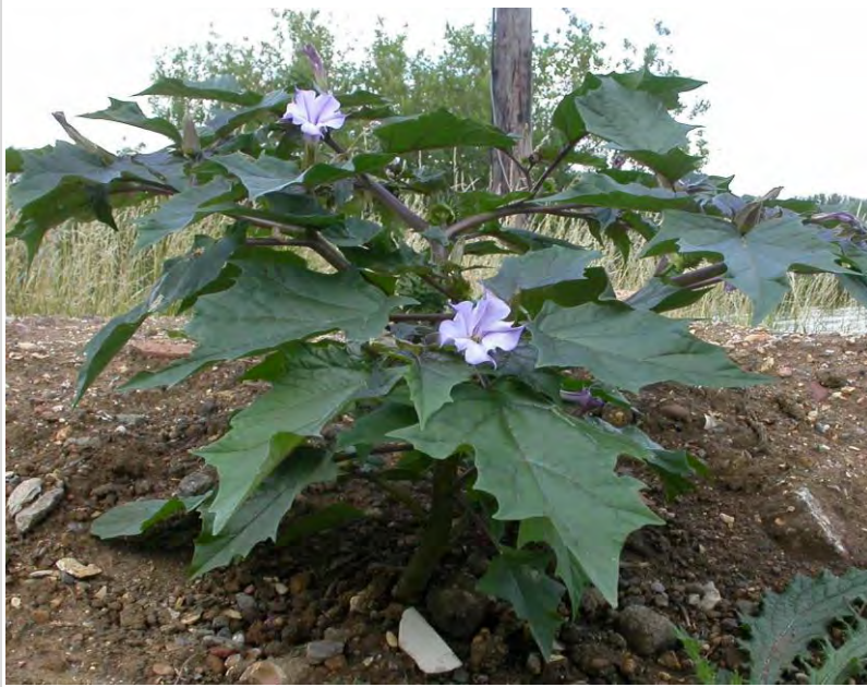
Datura stramonium var. chalybaea at Paxton pits