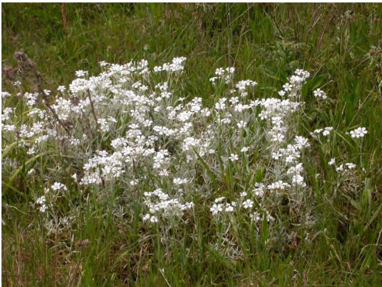
Cerastium tomentosum at Paxton Pits