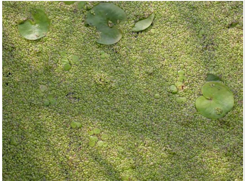
Lemna spp., Spirodela polyrhiza and Hydrocharis morsus-ranae at Woodwalton Fen