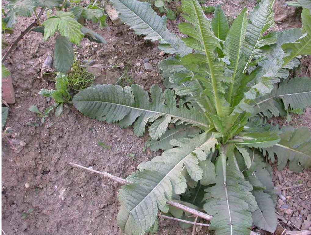
Cut-leaved Teasel ( Dipsacus laciniatus ) by the A1 South Lake