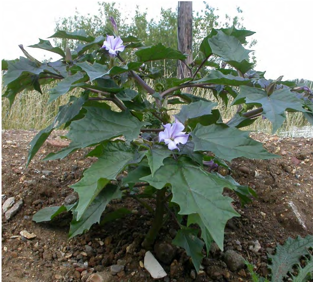
Thorn-apple ( Datura stramonium var. chalybaea ) by the track to the water-skiing centre