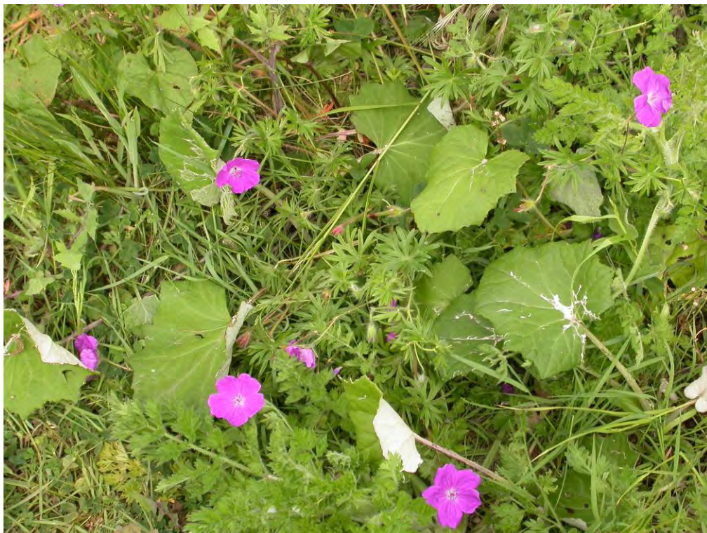
Bloody Crane's-bill ( Geranium sanguineum ) by A1 North Lake