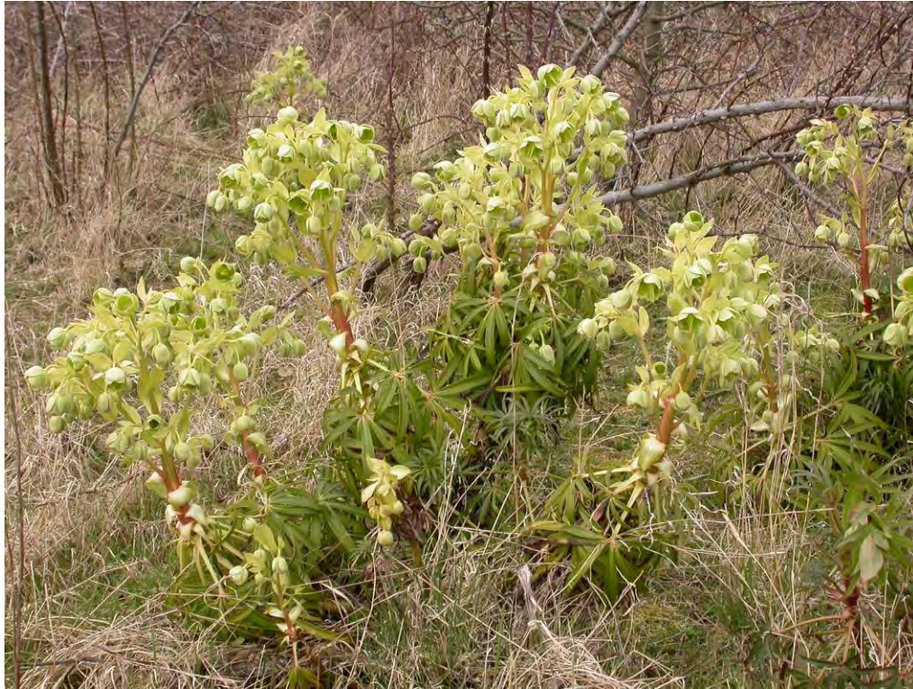
Stinking Hellebore ( Helleborus foetidus ) to the east of Cloudy Pit