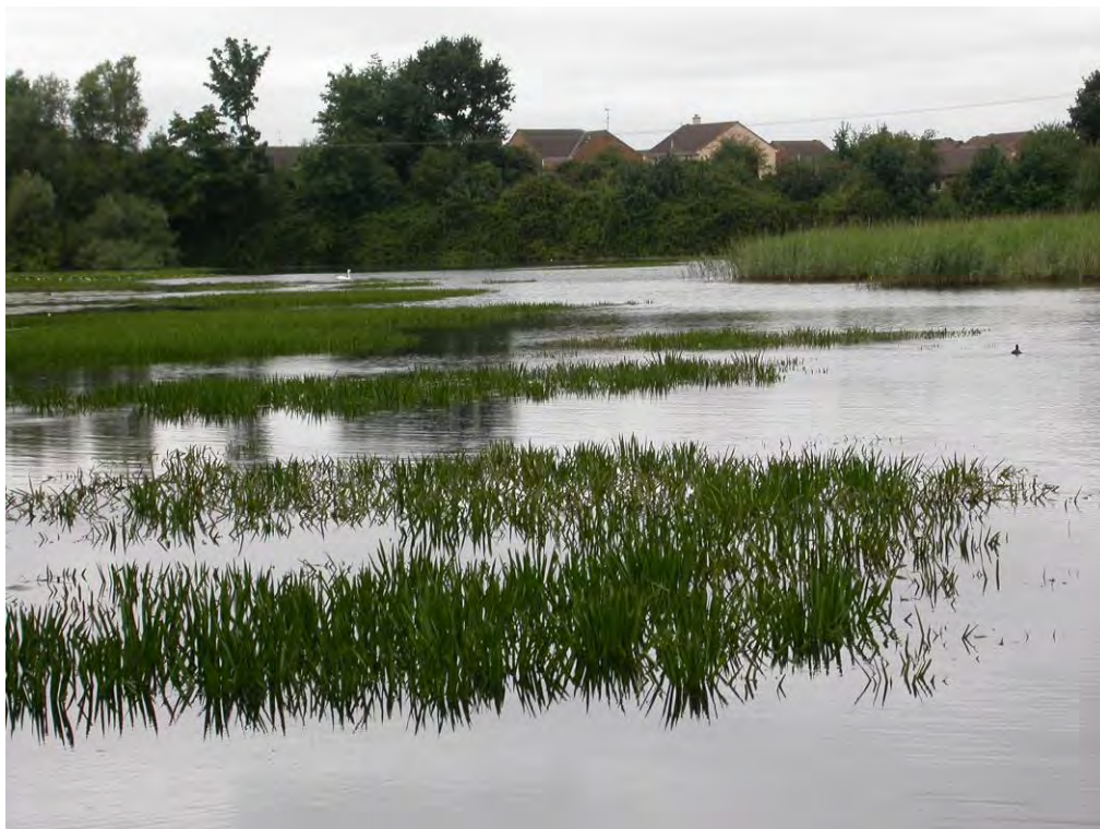
Water-soldier ( Stratiotes aloides ) in Hayling Pit