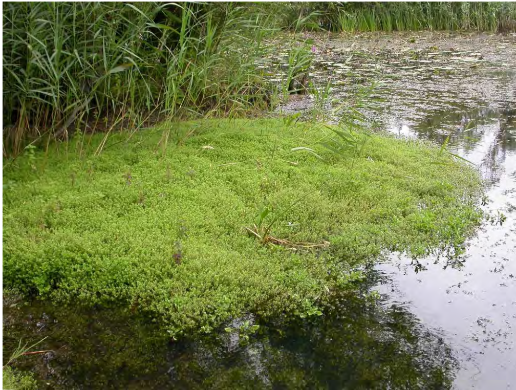
New Zealand Pigmyweed ( Crassula helmsii ) in Cloudy Pit