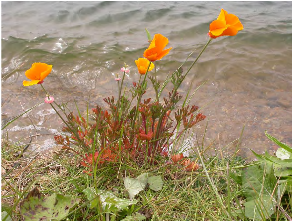
California Poppy ( Eschscholzia californica ) by A1 North Lake