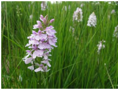
A pleasing sight was several dozen spikes of Dactylorhiza maculata .

Moving across a dense bracken-covered slope, we encountered frequent Rubus ideaus (Raspberry), before dropping back down towards the stream through a series of highly productive flushes. These occupied us for some time, with Narthecium ossifragum (Bog Asphodel), plenty of Wahlenbergia hederacea (Ivy-leaved Bellflower), an abundance of Drosera rotundifolia (Round-leaved Sundew), and a single plant of Veronica scutellata (Marsh Speedwell). We also found Dactylorhiza maculata (Heath Spotted Orchid), and Greg Nuttgens demonstrated how careful insertion of the tip of a grass stem into the flower could detach the pollinia, in the same manner as insects do. Incidentally, this mechanism is virtually unique to orchids, and was described by Darwin as one of the ways they avoid self-pollination.