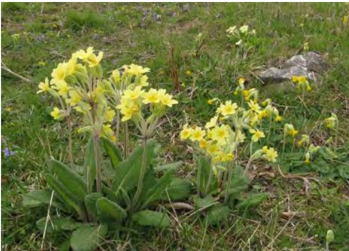
Primula on Mynydd Ruthin – P. vulgaris (back right), P. veris (middle right) and the hybrid (front).

With both woodlands now thoroughly explored, we headed back up to Mynydd Ruthin. As former heathland struggling with a Pteridium aquilinum (Bracken) problem, we had not expected a great deal here, but were pleasantly surprised by the moderate diversity of the grassland, enhanced by more Neottia ovata , several good patches of young Ophioglossum vulgatum (Adderstongue Fern), and locally abundant Dactylorhiza fuchsii . The most striking feature was the locally abundant Primula vulgaris (Primrose), occasional P. veris (Cowslip), and scattered clumps of the showy hybrid where they came into proximity. Heading back to the car park, Julian confirmed the presence of a little Agrostis canina (Velvet Bent) and Polygala serpyllifolia (Heath Milkwort), with both white and blue flowers, indicating a more acidic influence in this otherwise apparently neutral grassland.