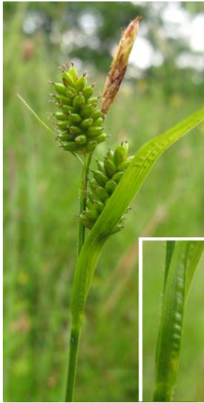
Carex pallescens showing its distinctive pale-green fruiting heads and crimped base to the longest bract.

Back on the southern side of the stream, and further upslope, we first passed through a relatively species-poor pasture with little of interest except frequent Conopodium majus (Pignut). A second, damper pasture further on proved to be much more rich. As well as some Valeriana dioica (Marsh Valerian) and Alchemilla xanthochlora (Pale Lady's-mantle), a pleasing find was abundant Carex pallescens (Pale Sedge).