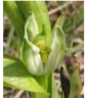
The unfolding petals of this Ophrys apifera appear to be white.