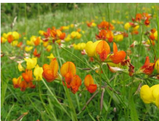
The field corner had some Lotus corniculatus with rather more orange flowers than normal.

Having negotiated a barbed wire fence on this increasingly ill-defined footpath, we found ourselves in the corner of a large sloping pasture with a nice mix of common species, including Linum catharticum (Fairy Flax), Centaureum erythraea (Common Centaury), Briza media (Quaking Grass), and some good patches of flowering Anagallis tenella (Bog Pimpernel). Also noticed was Potentilla anglica (Trailing Tormentil), distinguished from P. erecta (Tormentil) by having some five-petalled flowers amongst regular four-petalled ones – although as it wasn't fruiting it could equally have been the hybrid.