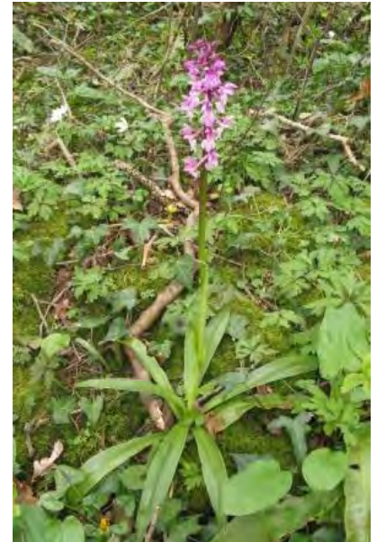
At the top of the wood was Orchis mascula without the usual leaf-blotches.

The adjacent Coed Breigam had a very similar flora to Coed Pant-llywydd, but with (if anything) less variety. This was not to say that it was dull, for the dominance of Anemone nemorosa and/or Hyacinthoides non-scripta (Bluebell), both in full flower, made for a delightful scene. However, we did feel a little short-changed from our hour-long visit – just about the only points of interest at the top of the wood were a single spike of Orchis mascula and a scattering of Viburnum opulus (Guelder Rose), while the lower slopes were similarly unremarkable. Even Allium ursinum was restricted to the bottom of the wood, although there was quite a bit of Veronica montana (Wood Speedwell) and another