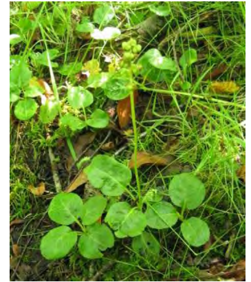
Pyrola rotundifolia (in seed) growing in dense shade in its well-known locality here.