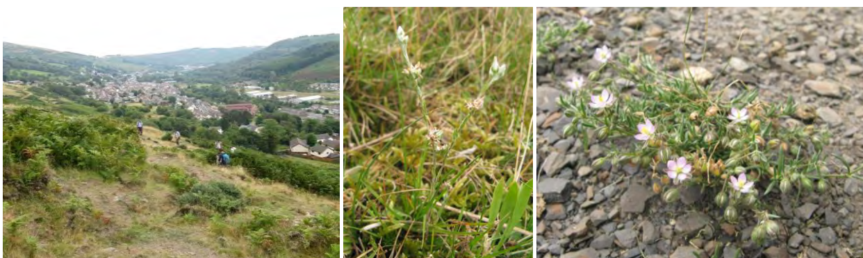
The spoil heaps (left) held Filago minima (middle) and Spergularia rubra (right).

Moving up-slope, we stopped for lunch with fine views looking up Rhondda Fawr, and then pressed on into an area of spoil heaps with skeletal soils. Typical coal-heap plants such as Carlina vulgaris (Carlina Thistle) and Filago minima (Small Cudweed) were in rather short supply, but we were pleased to see five plants of Spergularia rubra (Sand Spurrey), confined to a single spot in fine scree.