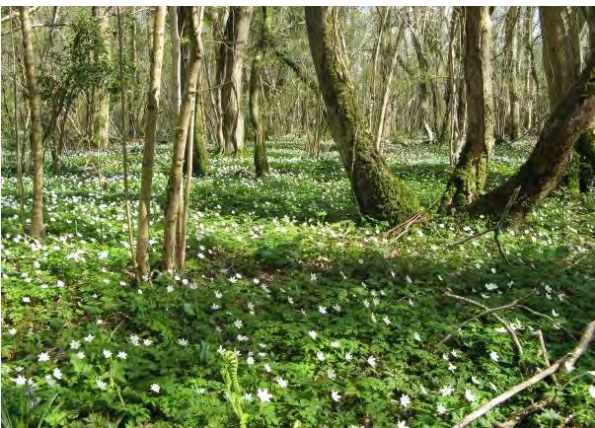
The flat top of Coed Breigam was a sea of flowering Anemone nemorosa .

We then retraced our steps back to the farm, passing into a steep horse-grazed paddock. Here, a small area with some exposed limestone had frequent Viola hirta (Hairy Violet) and Poterium sanguisorba ssp. sanguisorba (Salad Burnet), and also one square metre of Helianthemum nummularium (Common Rock-rose).