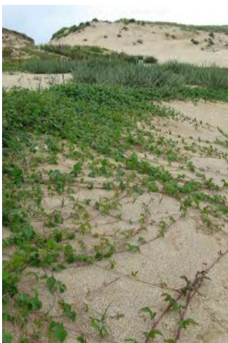
Rubus caesius can rapidly colonise fresh sand.

Moving south down the Haul Road, we saw Allium vineale (Wild Onion or Crow Garlic) with, unusually, plenty of flowers (now faded), but we failed to find any Clinopodium acinos (Basil Thyme) in the spot where it had been seen in 2009.