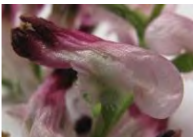
Fumaria muralis ssp. boreoi showing the relatively large ovate sepals with strong denticulations that serve to distinguish it from F. bastardii (Tall Ramping Fumitory).

Moving east along the coast path, we found Cirsium acaule (Creeping Thistle) and more Ranunculus parviflorus before dropping down into the shallow valley known as ‘The Dams’. Beyond here, a strip of grassland held a curious mix of Bromopsis erecta (Upright Brome) and Vicia nigra (Common Vetch), but little else of interest. Further on, a long-abandoned quarry was typical of many old quarries on limestone elsewhere in Britain, with rabbit-nibbled turf and a range of typical species including Polygala vulgaris (Common Milkwort), Briza media (Quaking Grass) and Anacamptis pyramidalis , along with Vulpia bromoides (Squirreltail Fescue) in one spot.