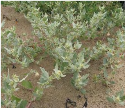
The distinctively frosted leaves of Atriplex laciniata seen on a quick hop over the River Kenfig.