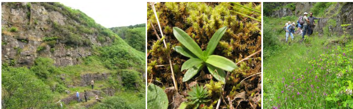
A lengthy search of the cliff-ledge site for Dianthus armeria (left) turned up only a handful of plants, some as their first-year rosettes (middle) ... but Betonica officinalis was abundant (right, foreground).

We then moved up into the quarry where Dianthus armeria (Deptford Pink) had been known since its discovery here by Julian in 1997. However, we found the population of this pretty biennial to be much diminished from the hundreds previously reported on the ledges at the far side, with just seven flowering plants and four vegetative rosettes being seen after a half-hour search and lunch stop. The most remarkable feature of this quarry, however, was the vast quantity of Betonica officinalis (Betony) – to the exclusion of all other plants in the slopes leading up to the northern face. Although a fine sight, we wondered whether such robust plants could really be native, or whether they might instead be a horticultural variant. A little to the south-east, another location for Dianthus in a smaller quarry was found to have been overcome by tall vegetation.