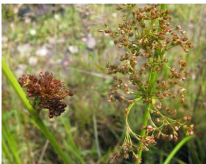
Along the riverside track at Cwm Clydach, Juncus effusus var. subglomeratus (left) was compared with the regular form (right).

A warm, sunny day saw 12 botanists gather in the lower car-park in these former colliery workings, and head west along the banks of the river, soon encountering hybrid swarms of Dactylorhiza fuchsii (Common Spotted Orchid) and D. praetermissa (Southern Marsh Orchid). As we were to find later, human intervention in the flora was apparent, with species such as Trifolium hybridum (Alsike Clover) being likely to have come from a seed mix when the site was landscaped. Further on, Juncus effusus (Soft Rush) was displaying its compact-headed variety, with the smooth stems that distinguish it from J. conglomeratus (Compact Rush).