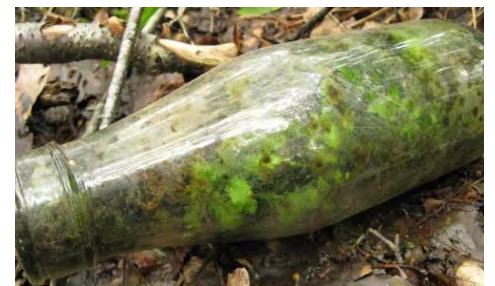
An enterprising Dryopteris dilatata !

We then headed along the banks of the stream, finding a mix of woodland and grassland species, including Carex laevigata (Smooth-stalked Sedge). A surprise find was Dryopteris dilatata (Broad Buckler Fern) growing completely within a glass bottle! Leaf characteristics were used to confirm Scutellaria minor (Lesser Skullcap) from a small damp area near the river, while further along the vegetative features of oaks ( Quercus spp.) caused some discussion.