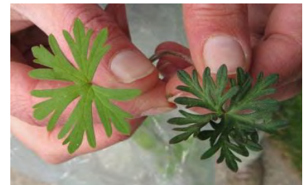
The keys in 'Poland' rely on petiole characteristics to distinguish vegetative Geranium dissectum (left) from G. columbinum (right), but the leaf colours of plants we found were quite distinct.