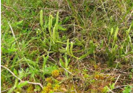
Lycopodium clavatum was seen in small quantity.

autumnalis (Autumn Hawkbit) and L. saxatile (Lesser Hawkbit) allowed a comparison of leaf features. The surprise of the day, though, was when Mike Jones stumbled across two flowering plants of Dianthus on the track. No more was found, but there is plenty of suitable habitat, and we speculated whether plants here had given rise to the quarry populations, and where (or indeed whether) the plants had occurred before industrialisation.