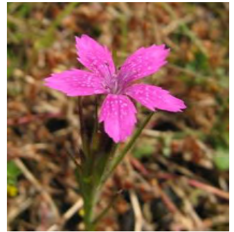
One of the two flowering Dianthus armeria seen in a new site on the spoil heaps.

Heading up over the top of the spoil heap and into the forestry on the far side, we inspected the very small populations of Lycopodium clavatum (Stag's-horn Clubmoss) and Huperzia selago (Fir Clubmoss) on a trackside bank, previously noticed here by Rob & Linda. The habitat was not particularly remarkable, and we wondered if more might be found in the area. Most of our group then headed back to the cars, finding on the way back over the spoil-heap a few plants of Sagina nodosa (Knotted Pearlwort).