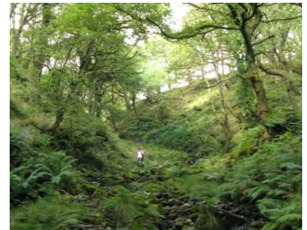
Clambering down the rocky valley of the Nant-y-Lamb.