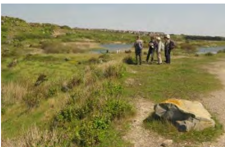
Surveying the central quarry.

Clambering out of this quarry and heading back east, we briefly dropped down to the shore to examine the known site for Adiantum capillus-veneris (Maidenhair Fern) on the cliffs, on the way pausing to admire an ammonite over 70cm in diameter embedded in the wave-cut platform.