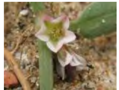
Close inspection of Polygonum oxyspermum ssp. raii showed the surprisingly attractive flowers and relatively large fruits (bottom centre).