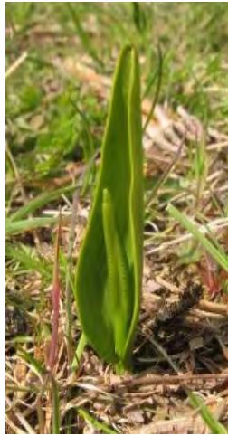
We were pleased to see Ophioglossum vulgatum in the short turf.

patch of pink-flowered Anemone nemorosa . In both woods, a factor in the lack of diversity may be the low water table due to the presence of the adjacent (very deep) quarries – indeed, we paused for a moment at the top of Coed Breigam to consider the rarity of a dry, flat, calcareous woodland in a Welsh context!