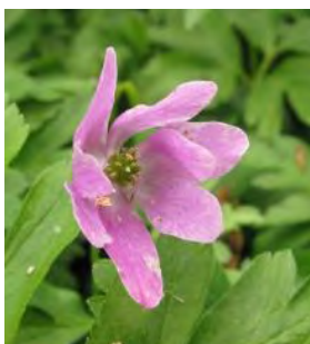
We found some strongly pink-coloured Anemone nemorosa in Coed Pant-llywydd.

Moving down the lane and past the quarry entrances, we were pleased to see a small quantity of Neottia ovata (Twayblade) on the bank, and further down abundant Lamiastrum galeobdolon ssp. montanum (Yellow Archangel). Some leaves of this displayed a silvery colouring that can cause confusion with the introduced ssp. argentatum , but the coloration in the native subspecies is not so extensive and is only apparent early in the year.