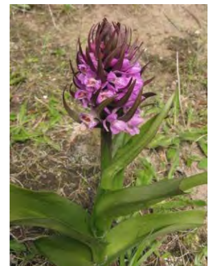
Some of the Dactylorhiza praetermissa had very broad leaves, and this plant in particular was robust to the point of ugliness, with very long bracts.

With the sun still shining, we headed back, noting on the way the non-native grass Anisantha madritensis (Compact Brome) and Valerianella locusta (Common Cornsalad) around the base of the quarry cliff – much less common these days than V. carinata (Keeled Cornsalad). Finally, we saw a fine patch of Fumaria muralis ssp. boreoi (Common Ramping Fumitory) by a flight of steps leading up into a housing estate.