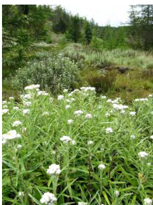
Anaphalis margaritacea was abundant on the spoil heaps.

Then we began the long climb up to the spoil-heaps at the top of Mynydd Pwllyrhebog, finding on the way a patch of Salix repens (Creeping Willow) in short, dry grassland. Towards the top, we were rewarded by a 3-metre colony of Phegopteris connectilis (Beech Fern) in a horizontal joint in a rocky outcrop.