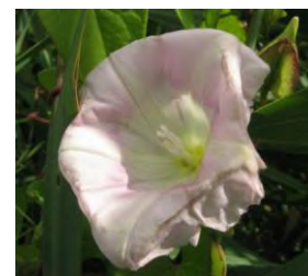
The pink-flowered Calystegia sepium that we should have looked a little more closely at!

Staying close to the river edge, we found a couple of patches of Calystegia sepium (Hedge Bindweed) with pale pink flowers. Unfortunately at the time we did not inspect the leaves and shoots for hairiness, which would have enabled us