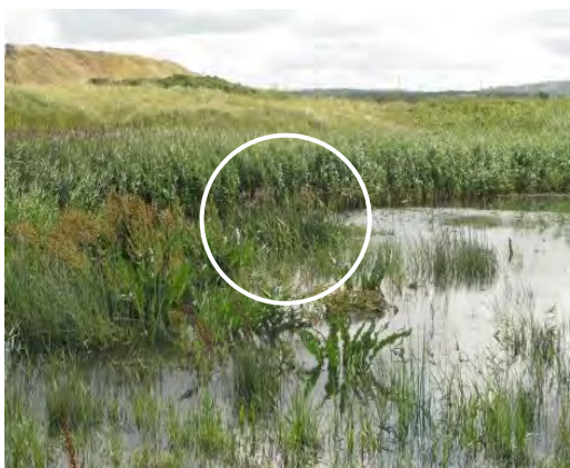
Butomus umbellatus in the River Kenfig.

* Each nested quadrat consists of a central 50 x 50 cm quadrat within which all species were recorded, along with cover values. We then recorded the presence of any additional species in a 1 x 1 m quadrat, then moving out to a 2 x 2 m quadrat, a 5 x 5 m quadrat, and finally to the complete scrape. This type of sample records the occurrence of species over a reasonably large area, but places the emphasis of more detailed recording (cover values) at a level where observer error is likely to be at its lowest (50 x 50 cm)].