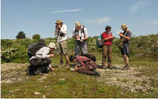
There was lots to see in the westernmost quarry, despite appearing rather desolate initially.

the barest turf one group of Saxifraga tridactylites (Rue-leaved Saxifrage) and a few Spiranthes spiralis (Autumn Lady's-tresses). The orange-coloured carrot-smelling inner bark of a shrub enabled identification as Rhamnus cathartica (Buckthorn), but we didn't have the patience to key out any of the Cotoneaster species, apart from the distinctive C. horizontalis (Wall Cotoneaster), which was predominant here. A very large Ficus carica (Fig) was noted along the eastern side of the quarry, while a single plant of Ophrys apifera (Bee Orchid), with flowers yet to open, seemed to have petals without the usual pink colouring.