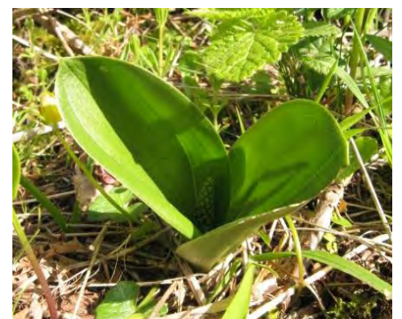
A young rosette of Neottia ovata near Pant-llywydd Farm.

After checking with the farmer as arranged, we moved into Coed Pant-llywydd, splitting up into groups to cover the lower and higher parts. The wood proved to be very pleasant, with abundant Anemone nemorosa (Wood Anemone), in a couple of places with pink-coloured flowers. Ficaria verna