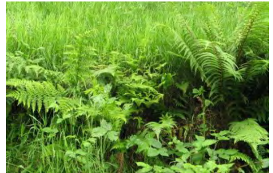
The fine fern assemblage including Phegopteris connectilis (centre).

Beyond this, in an area of otherwise unremarkable oak woodland, we found six large fern species within one 2-metre stretch of bank. These were Athyrium filix-femina (Lady Fern), Blechnum spicant (Hard Fern), Dryopteris affinis agg. (Scaly Male Fern), D. dilatata (Broad Buckler Fern), Oreopteris limbosperma (Lemon-scented Fern), Pteridium aquilinum (Bracken), and best of all a single clump of Phegopteris connectilis (Beech Fern), a rare plant this far south in the vice-county (although