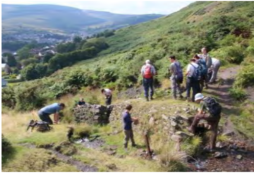
We spent some time examining stream-side plants next to an exposed drainage chute – itself an excellent habitat for Asplenium trichomanes .

examined it, took over 3 minutes to find again when a later arrival asked to have it shown, despite five of us peering intently at the spot!