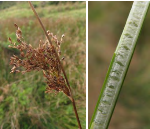
The combination of upswept flowering heads and ‘obscurely discontinuous’ pith of this Juncus indicate it’s a hybrid.