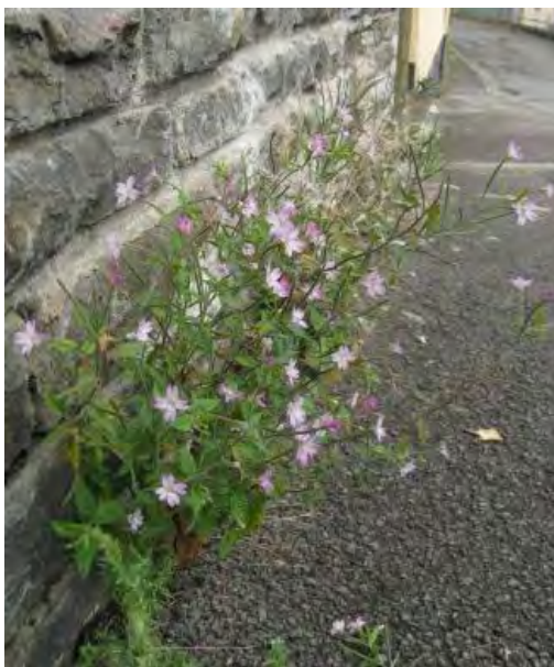
We found the attractive Epilobium montanum as a pavement weed in one spot.

Upslope of an old drainage chute, we found a small quantity of Drosera rotundifolia (Round-leaved Sundew), while a broad water-filled ditch running along the contours held a large expanse of entirely vegetative Carex riparia (Greater Pond Sedge). Nearby, damp ground yielded the distinctive hybrid Juncus effusus (Soft Rush) x J. inflexus (Hard Rush), and a couple of clumps of Dryopteris carthusiana (Narrow-leaved Buckler Fern) courtesy of Paul Green’s sharp eye.