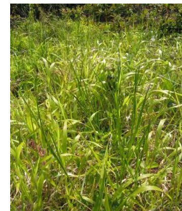
Lathyrus nissolia (dark green leaves) is a classically difficult plant to spot...