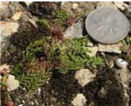
David's hope of identifying this non-flowering Taraxacum was nearly as small as the plant itself!

the barest turf one group of Saxifraga tridactylites (Rue-leaved Saxifrage) and a few Spiranthes spiralis (Autumn Lady's-tresses). The orange-coloured carrot-smelling inner bark of a shrub enabled identification as Rhamnus cathartica (Buckthorn), but we didn't have the patience to key out any of the Cotoneaster species, apart from the distinctive C. horizontalis (Wall Cotoneaster), which was predominant here. A very large Ficus carica (Fig) was noted along the eastern side of the quarry, while a single plant of Ophrys apifera (Bee Orchid), with flowers yet to open, seemed to have petals without the usual pink colouring.