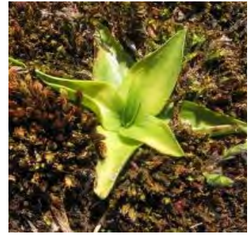
The 'trullate' (trowel-shaped) leaves of this orchid helped us to identify it as Spiranthes spiralis .

Back in the main quarry area, our first find was a single clump of Limonium binervosum agg. (Rock Sea-lavender) by the main footpath. A south-east-facing bank examined by David and Adam held plenty of an upright, non-native, form of