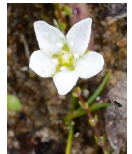
There was plenty of flowering Sagina nodosa in the newly scraped slacks.

Eastward, a newly scraped area had been dug a little deep, being a foot deep in water, but there was plenty of Baldellia ranunculoides (Lesser Water Plantain) around the margins. Other scraped areas had lots of Veronica anagallis-aquatica , and in one place a good colony of Epipactis palustris (Marsh Helleborine). Of concern, though, was the rapid invasion of Salix repens (Creeping Willow) and Rubus caesius (Dewberry) into freshly blown sand – just one of the problems facing those trying to re-establish mobile dune habitats here.